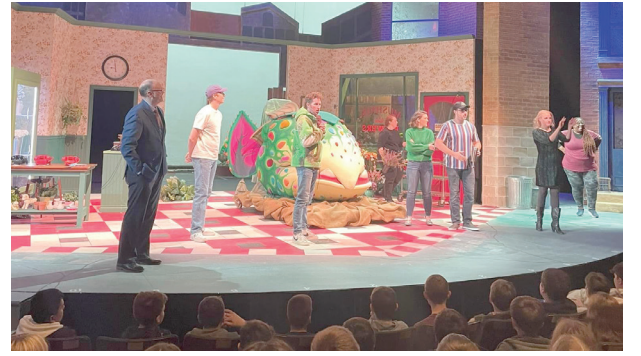
Imlay City Middle School students attended Meadowbrook Theater to see the Little Shop of Horrors. Students were able to travel by bus to the Theater and to see and experience this memorable play. Funding for this grant was provided by the Wakaresku Cultural Fund held at LCCF.