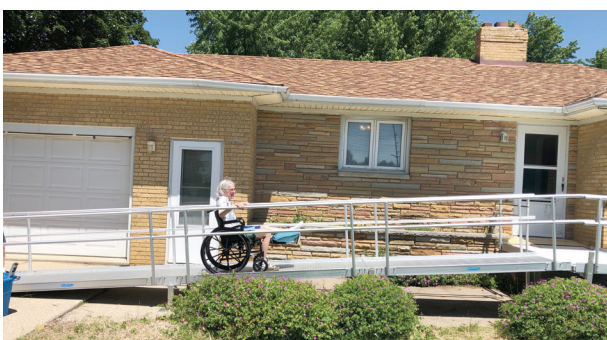
Habitat for Humanity received a grant to provide portable ramps for Lapeer County residents. Because the ramp is portable, it makes it easier to take down and transport to different clients in need.