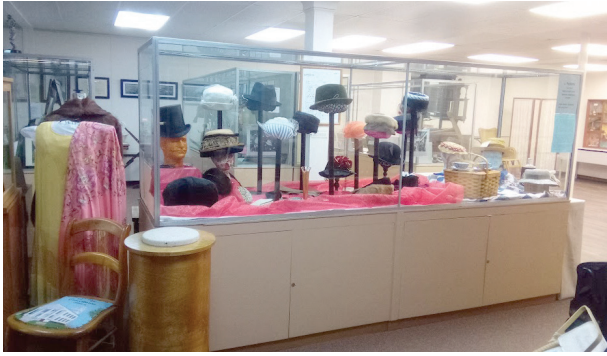
A grant was awarded to the Lapeer County Historical Society for renovations and for the purchase of new display cases. The staff there are very helpful and enjoy sharing historical information and preserving the history of Lapeer County.