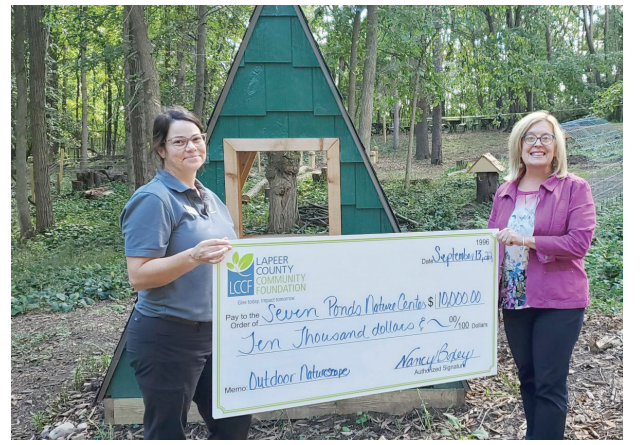
Seven Ponds Nature Center received funding from LCCF for an Outdoor Naturescape Gate. The naturescape is sectioned into many different areas of play for youth to learn and explore nature in many different forms.