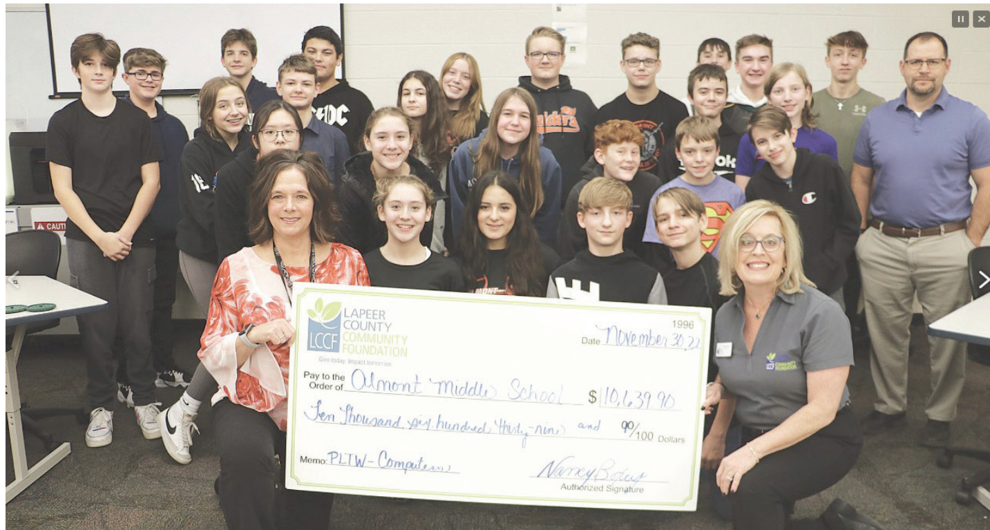
Almont Middle School received a grant totaling over $10,000 for computers supporting STEAM learning in the classroom through Project Lead the Way.