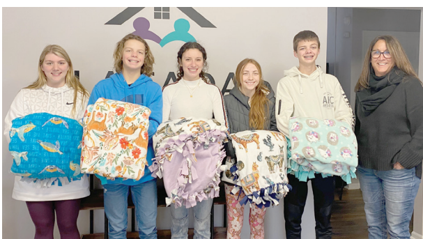
Each year the LCCF YAC purchases material and makes fleece tie blankets for Lapeer County residents in need. The blankets are given to LACADA, The Refuge Homeless Shelter and to police officers for their patrol cars to use in accidents or emergencies to help comfort children and keep them warm.