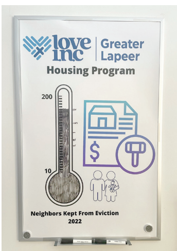
Love INC. received a grant from LCCF to help with Lapeer County families who are in jeopardy of being evicted from their homes or to help with late payments or shut off notices for their utilities.