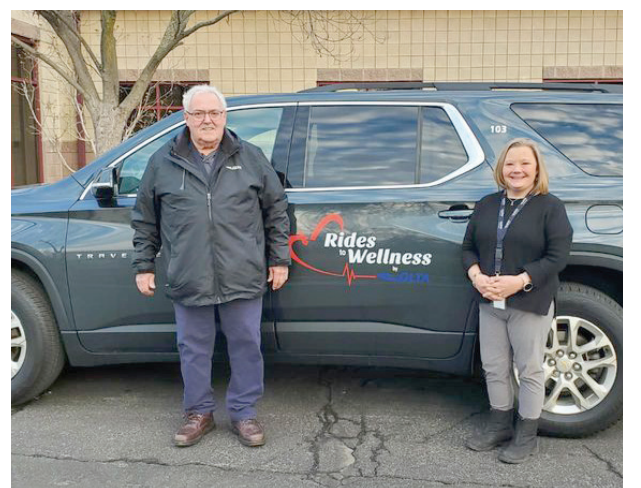
LCCF has worked in collaboration with local partners including the Four County Community Foundation, Greater Lapeer Transportation Authority, and the Lapeer County United Way to launch the Imlay City Micro-Transit project. Through the purchase of a car as well as an accessible van, Imlay City residents will have access to transportation for health-related needs.