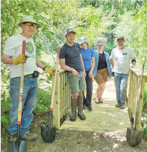
Funding was provided to Six Rivers Land Conservancy to support the Sutherland Nature Sanctuary and the habitat restoration project in Metamora. Lapeer County Students from the Construction Trades program assisted in assembling and building bridges, railings, and boardwalks along with many other volunteers.

In Lapeer County, we like to play. Whether it is spending time with our children at a community park, exploring a local trail or paddling down the Flint River, the outdoor recreation opportunities are endless. It calms our minds, strengthens our bodies, and connects us to nature in meaningful ways. We recognize the importance of expressing ourselves through art and music and letting our creative sides shine.