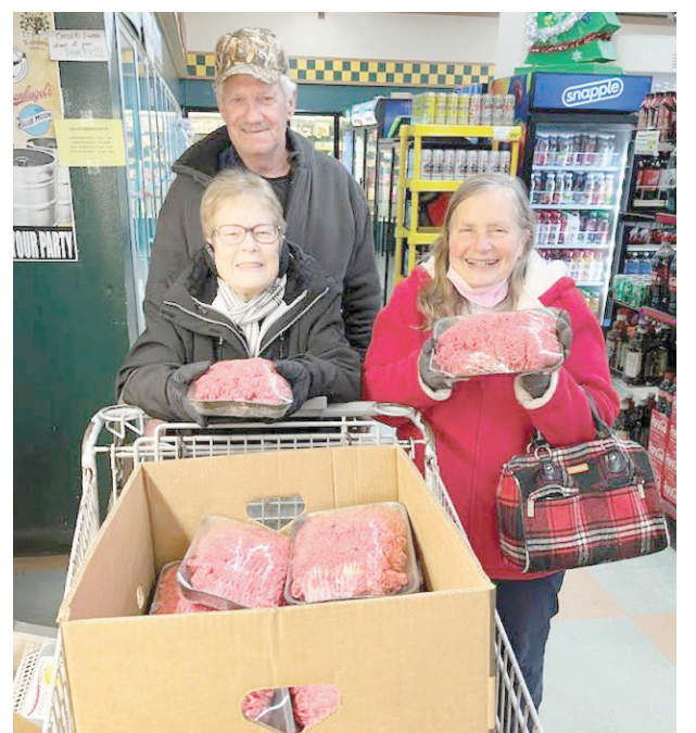
LCCF has provided nearly $25,000 for the purchase of 6,000 pounds of protein that has been distributed to 17 food pantries across Lapeer County.