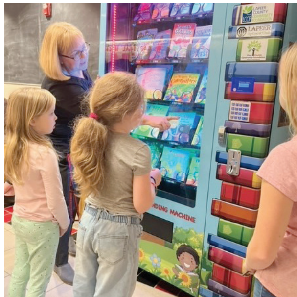
Students from Dryden Elementary will have years of fun using this new Book Vending Machine that was purchased in part from a grant from the LCCF YAC (Youth Advisory Committee).