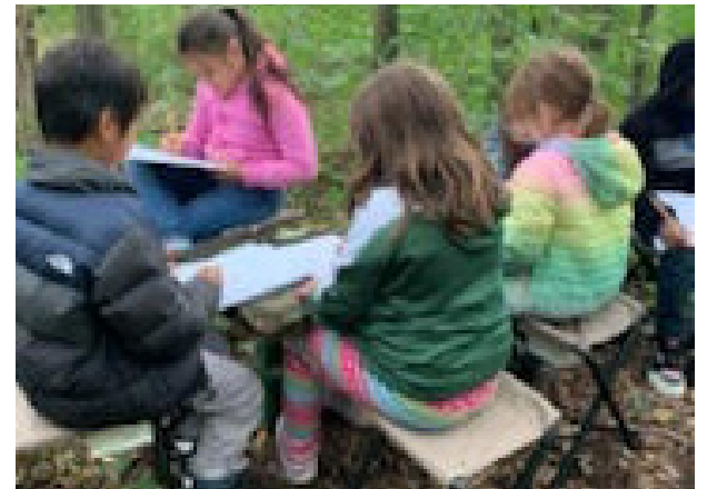
Students from Schickler Elementary were able to participate in Annie's Big Nature Lesson which is a five-day field trip to learn about nature and to explore Seven Ponds Nature Center.