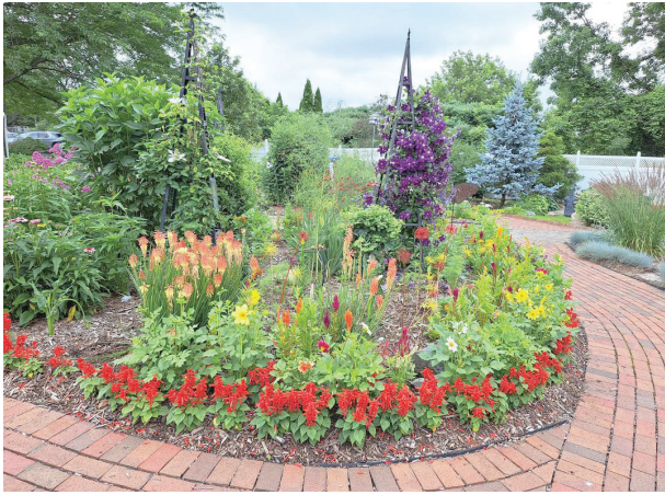
Funding was provided to Lapeer County Master Gardeners to host a workshop for Lapeer County residents about gardening. The master gardeners do a beautiful job keeping the gardens looking their best at the Suncrest Medical Care Facility and surrounding areas.