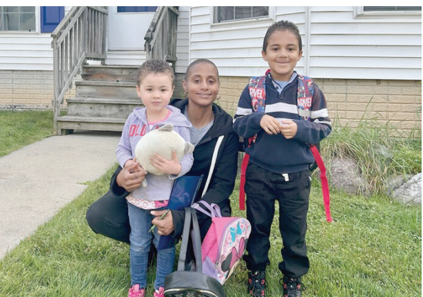
The Women's Fund provided a $10,000 grant to the Human Development Commission to provide household goods, beds, and other items for local women in need.