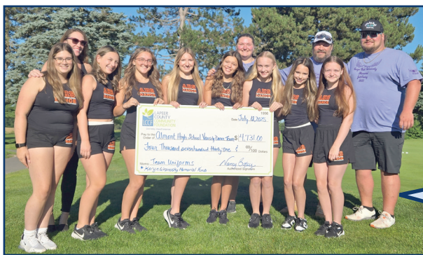
Karen Wranosky Memorial Fund

The Dave & Jackie Whitton/Big Sky Acres Memorial Fund supports the needs of the most vulnerable, such as hunger, homelessness, domestic violence, and compassionate care through hospice.