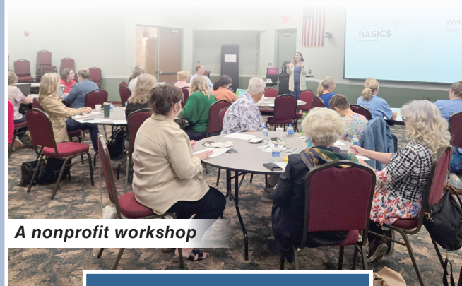
A nonprofit workshop

Together, we: Give today. Impact tomorrow.