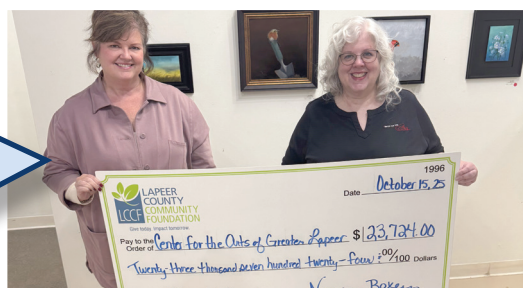
Center for the Arts of Greater Lapeer New Digital Sound System for PIX Theatre