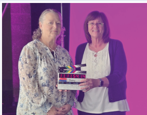
Pregnancy Center of Lapeer