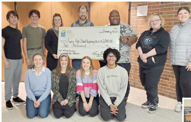
Lapeer Community Schools Lapeer High School Performing Arts Program - Sound System and Production Support

new sound systems at the Center for the Arts of Greater Lapeer ensure students, musicians, and audiences alike can enjoy high-quality performances where neighbors will gather and memories will be made. Each grant reflects our commitment to enriching community life, supporting local talent, and making the arts accessible to all residents. Over the past year, nearly $72,000 was granted across Lapeer County supporting arts and culture.