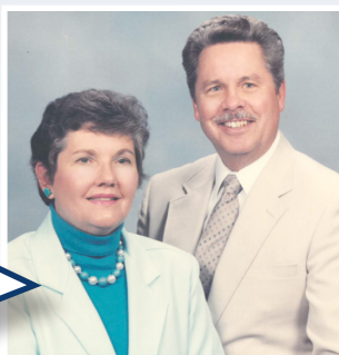
Bill and Verna Mae Valley Scholarship Fund