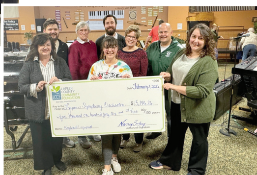
Lapeer Symphony Orchestra New Keyboard and Equipment