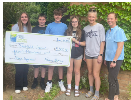
The Chatfield School Stage Upgrades