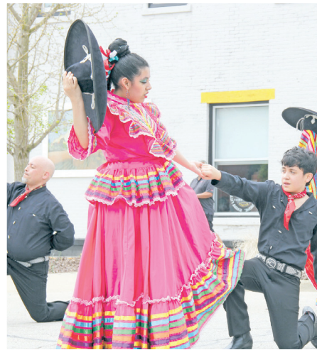
Hispanic Service Center of Imlay City Cinco de Mayo Celebration