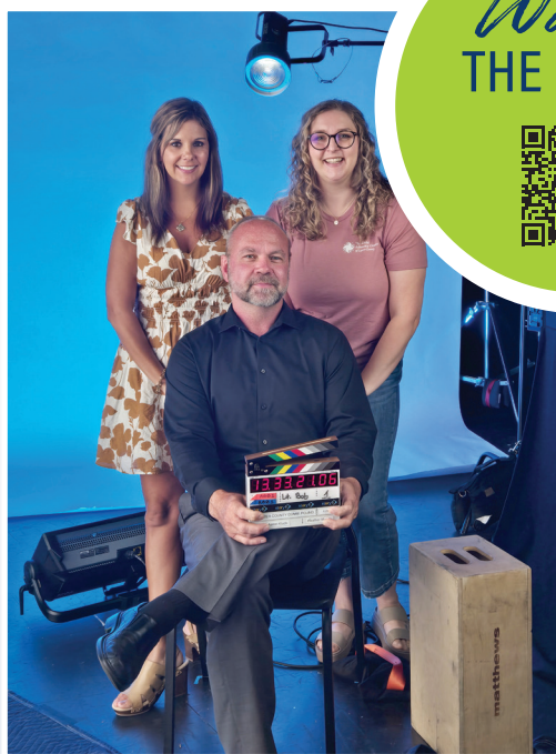
Child Advocacy Center