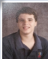
Christian & Cornell Barnard Memorial Camp Fund The Christian & Cornell Barnard Memorial Camp Fund shall provide grants to cover the cost for special needs and developmentally disabled youth in Lapeer County to attend camp, ensuring they have access to meaningful and enriching experiences that support their growth, development, and well-being.