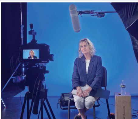
Habitat for Humanity of Lapeer