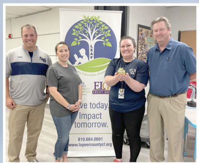
Ruth Fox Middle School Golden Apple Award recipient