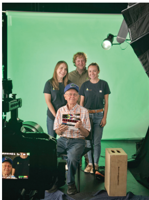
Six Rivers Land Conservancy

Beyond storytelling, we've continued investing in the strength and sustainability