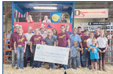
New Poultry Cages