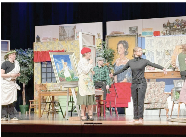
Almont High School Spring Play Production, You Can’t Take It With You